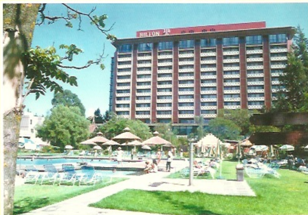
Host hotel for our Conference will be the lovely Hilton in Addis Ababa.