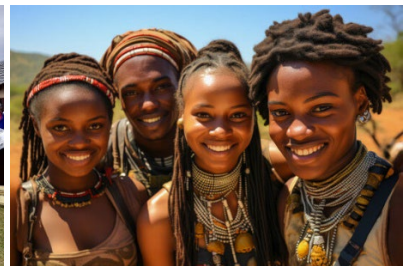
South Africa – The People – The culture