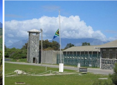
Robben Island Prison Museum