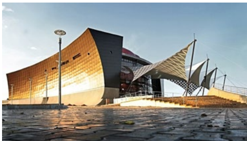
Hector Pietersen Museum