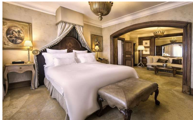
The Palazzo Hotel