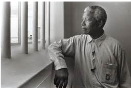
Mandela in his Prison Cell

DAY 02. MONDAY, JUNE 22, CAPE TOWN: Robben Island/Table Mountain/ Shopping. Breakfast. Early morning transfer to the Mandela Gateway at the Victoria & Alfred waterfront to board the first speedboat to Robben Island. Notoriously known as the prison where anti-apartheid leaders like the former Presidents of South Africa, Nelson Madela and the anti-Apartheid activists Jacob Zuma, Robert Sobukwe, Govan Mbeki were incarceration. You will visit the jail cell Mandela occupied during his 18 years of detention. Return to the mainland. Our next stop is the famous majestic Table Mountain. This mountain gets its name from its shape which from afar looks like an old dining table. To get to its 3,558 ft peak, we'll ride in cable cars. Apart from the breathtaking views and its diverse vegetation. Lunch (not included) on Table Mountain There are also very good gift shops to occupy your time. NOTE: This tour is optional and dependent on the weather conditions. The tour ends at the Alfred and Victoria Waterfront for shopping. Dining tonight will be at Cape to Cuba Beachfront Restaurant with live music, while watching the whales in the ocean. Return to the hotel. Overnight Accommodation: Accommodation: Southern Sun-Waterfront Hotel Meals: Breakfast