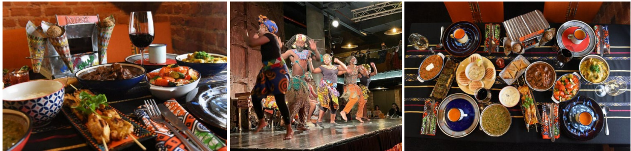
The Gold Restaurant – Excellent Cuisines – Exciting South African Cultural Shows