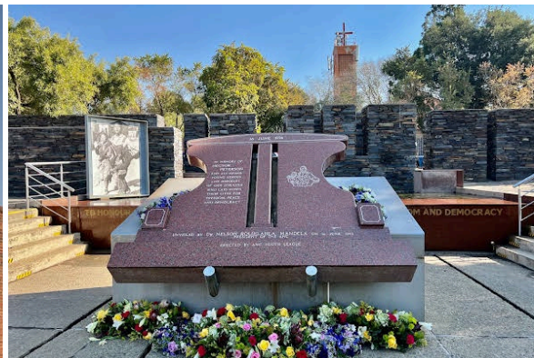
Hector Pietersen Museum Johannesburg

NOTE: For security reasons, check-in counter opens 4 hours before departure and closes 2 hours before takeoff. You are allowed to check-in 1 piece of luggage for free, weighing 50lbs or less, and 1 carry-on weighing 12lbs or less. Your passport must have at least 2 empty visa pages. United States passport holders do not need visas to enter South Africa.