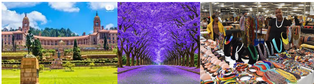
South African Parliament, Pretoria