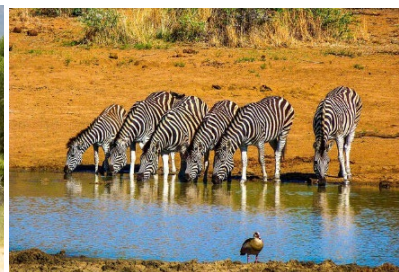
Pilanesberg National Park