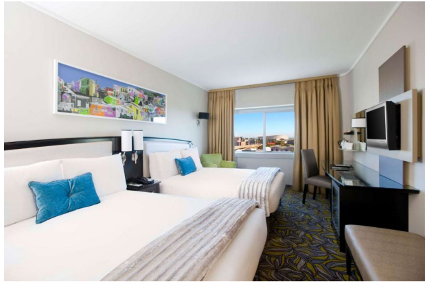
Southern Sun-Water Front Cape Town

DAY 02. MONDAY, JUNE 22, CAPE TOWN: Robben Island/Table Mountain/ Shopping. Breakfast. Early morning transfer to the Mandela Gateway at the Victoria & Alfred waterfront to board the first speedboat to Robben Island. Notoriously known as the prison where anti-apartheid leaders like the former Presidents of South Africa, Nelson Madela and the anti-Apartheid activists Jacob Zuma, Robert Sobukwe, Govan Mbeki were incarceration. You will visit the jail cell Mandela occupied during his 18 years of detention. Return to the mainland. Our next stop is the famous majestic Table Mountain. This mountain gets its name from its shape which from afar looks like an old dining table. To get to its 3,558 ft peak, we'll ride in cable cars. Apart from the breathtaking views and its diverse vegetation. Lunch (not included) on Table Mountain There are also very good gift shops to occupy your time. NOTE: This tour is optional and dependent on the weather conditions. The tour ends at the Alfred and Victoria Waterfront for shopping. Dining tonight will be at Cape to Cuba Beachfront Restaurant with live music, while watching the whales in the ocean. Return to the hotel. Overnight Accommodation: Accommodation: Southern Sun-Waterfront Hotel Meals: Breakfast