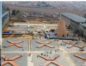
Freedom Charter Tower