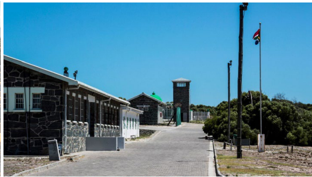
Robben Island where Nelson Mandela spent 18 years as a political prisoner – Cape Town