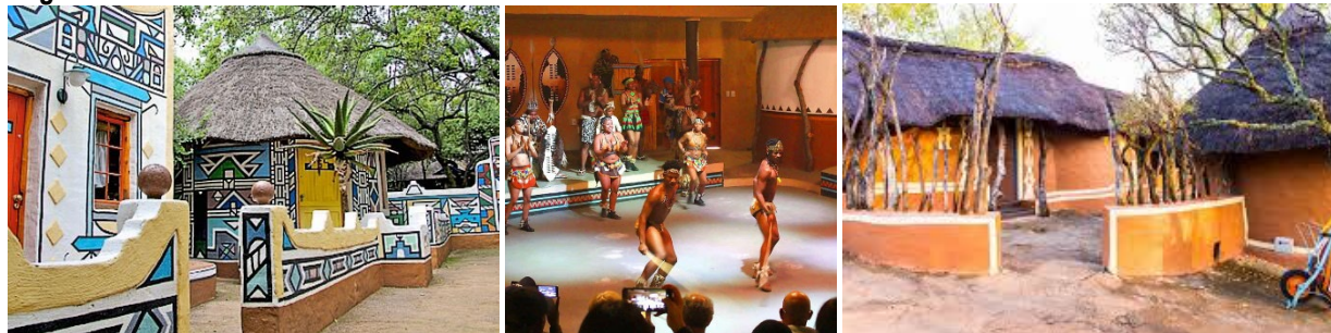
Lesedi Multi Cultural Village